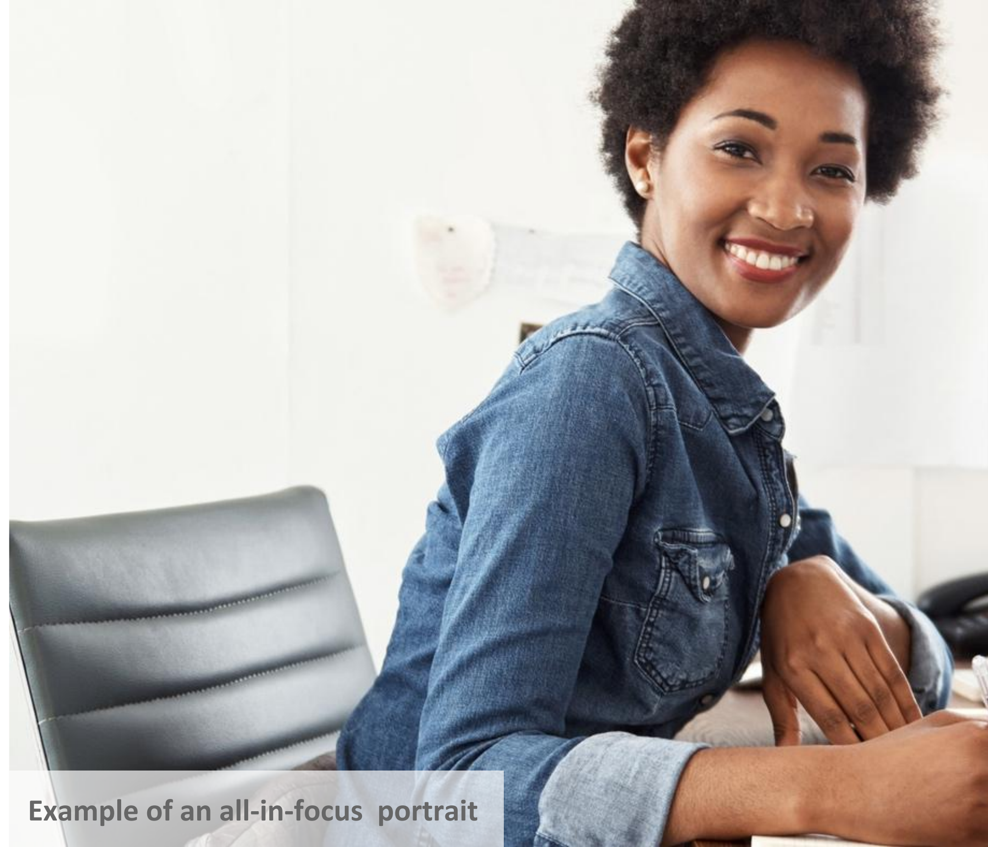
Example of an all-in-focus portrait