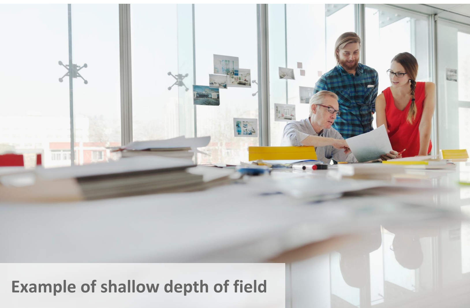
Example of shallow depth of field