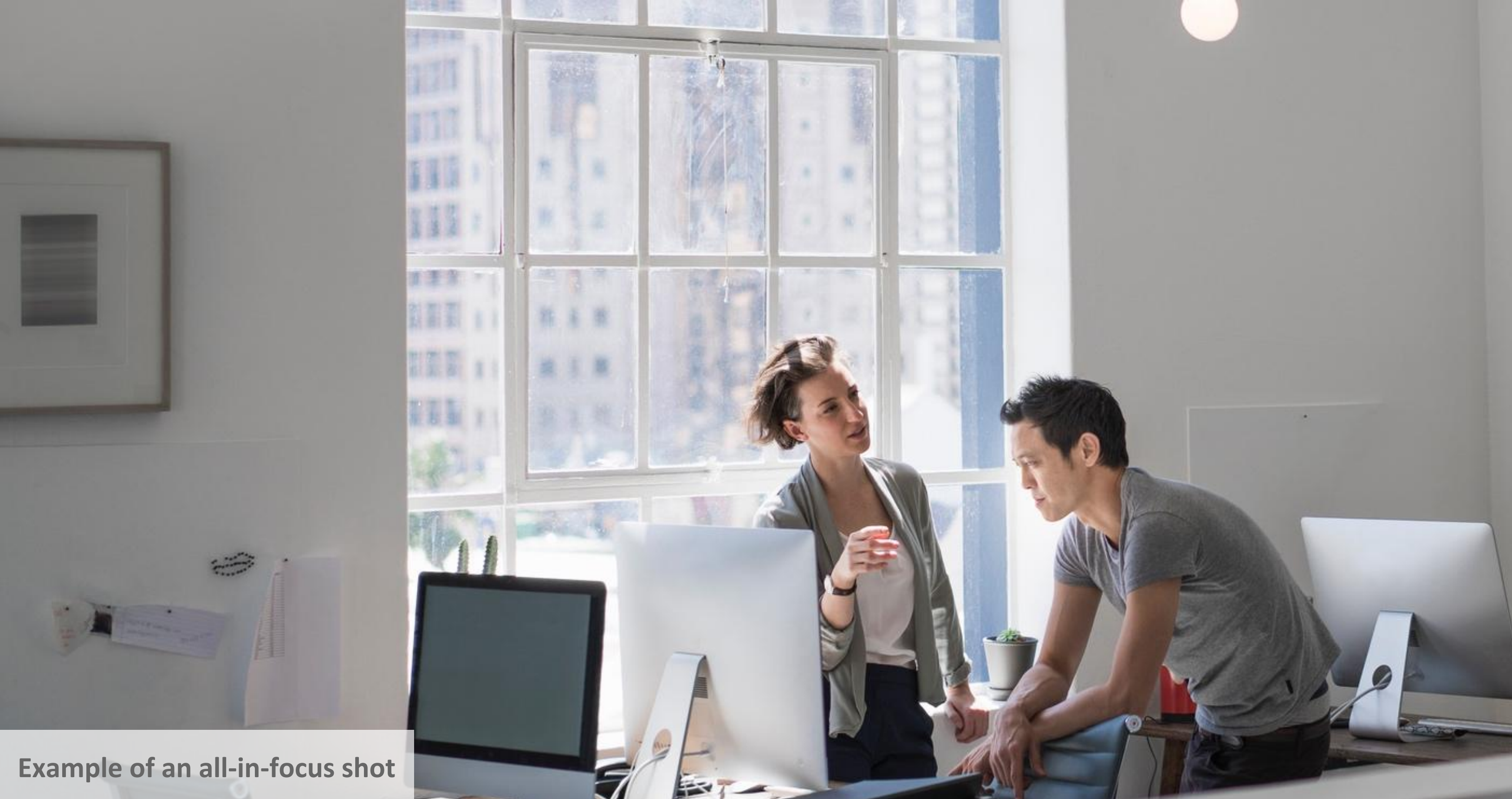
Example of an all-in-focus shot

It's best to have a mix of both photos where faces are identifiable, and where faces are obscured. For example, a person's face could be cropped slightly out of frame, blurred slightly, or at a side angle.