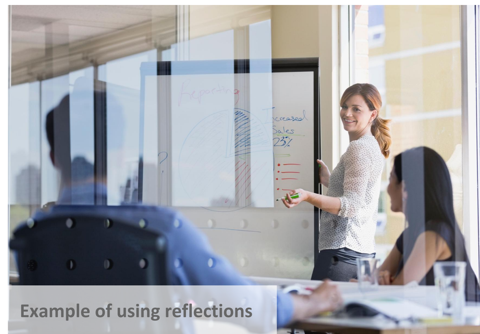
Example of using reflections