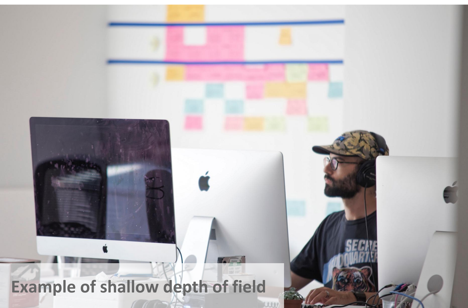
Example of shallow depth of field