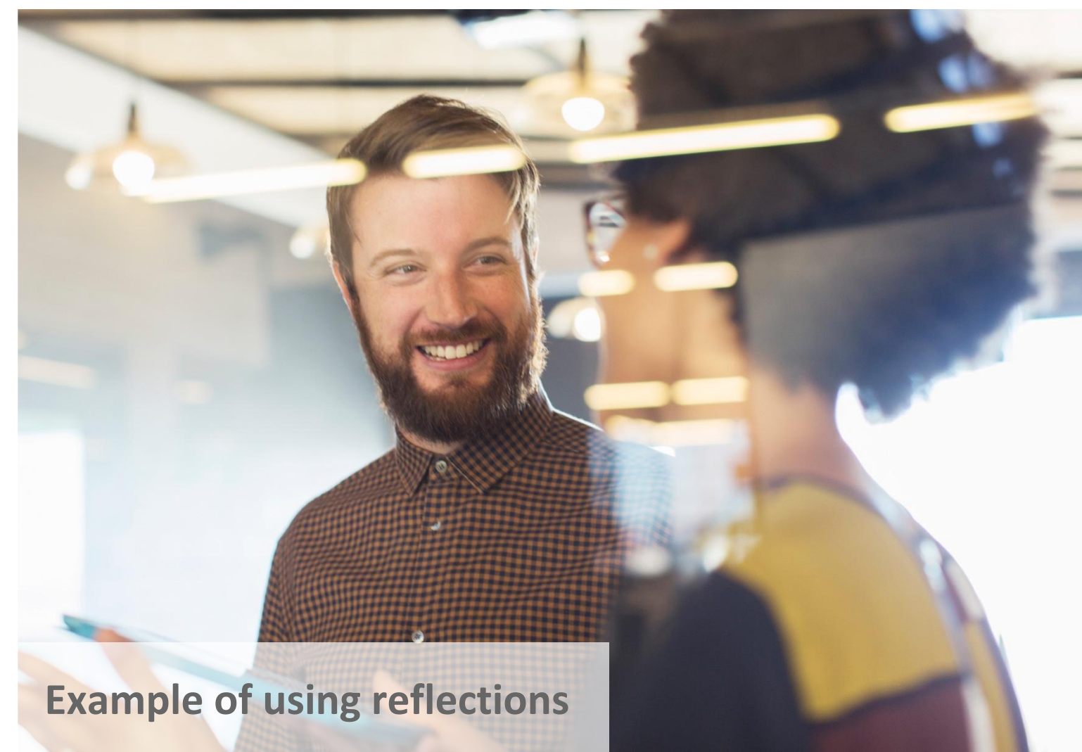
Example of using reflections