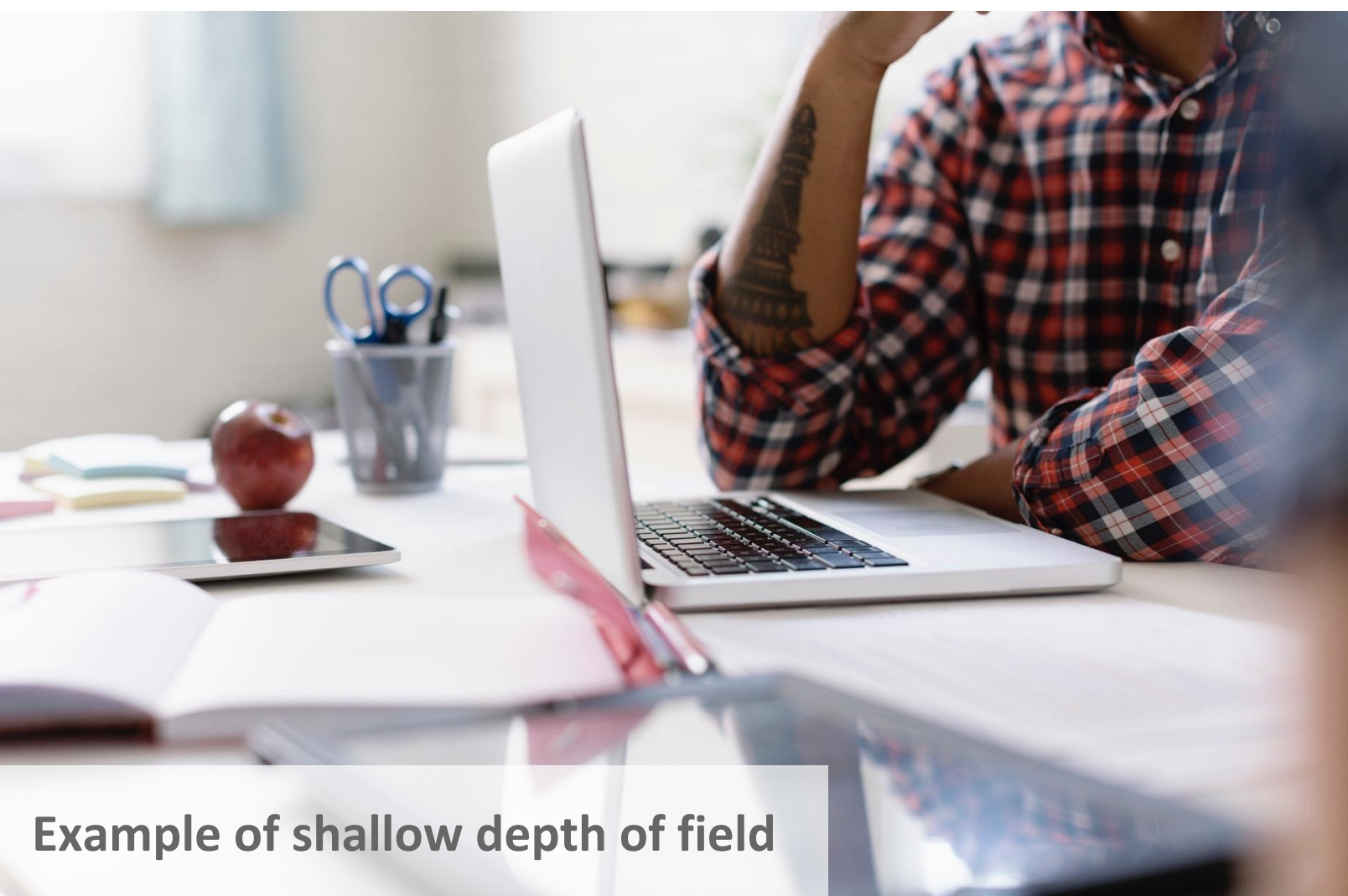
Example of shallow depth of field

Typically in these shots, the object or a person's action is the main subject of the photo.