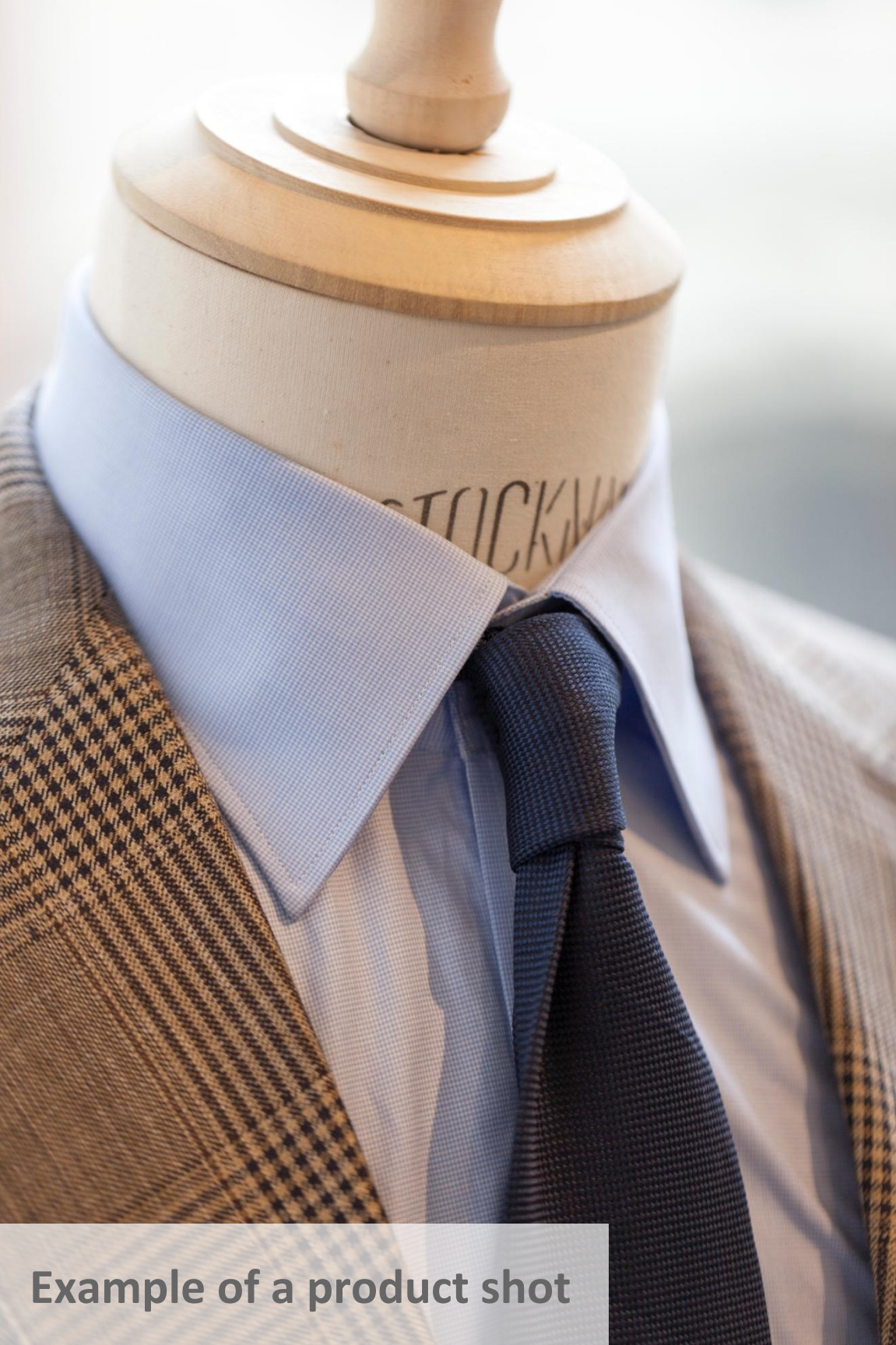
Example of a product shot