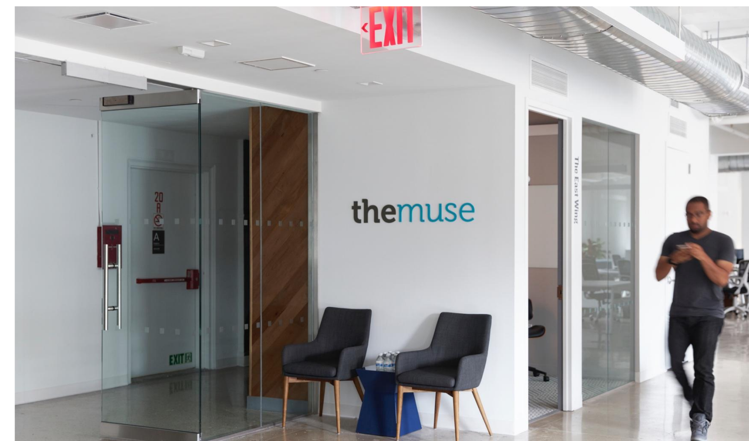
Example of with slight motion blur with a logo